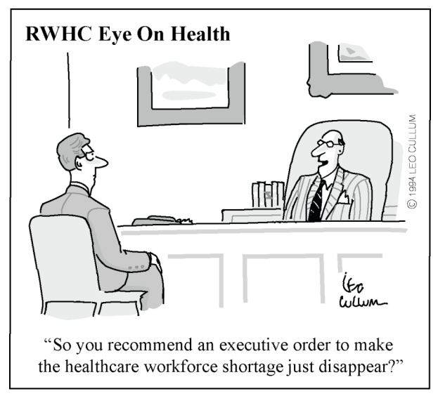
RWHC Eye On Health, 12/17/07

"By 2020, the Health Resources and Services Administration (HRSA) projects that more than one million new Registered Nurses will be needed in the U.S. health care system to meet the demand for nursing care. HRSA projects that nursing schools must increase their graduates by 90 percent in order to adequately address the nursing shortage. With preliminary data showing a 7.4 percent increase in graduations from baccalaureate nursing programs this year, schools are falling far short of meeting this target."