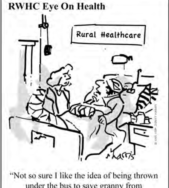
under the bus to save granny from going off the cliff fleeing death panels."

... increase or decrease the jobs available in rural America?